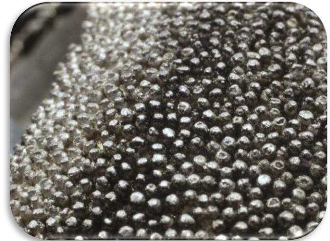
Worn teeth are broken / rounded and shiny .